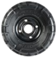
MSPN 68495, 67693, 65492, 64998 & 03488

Product measurements are subject to change and are listed here for your convenience. Please see your Michelin representative for up-to-date data.