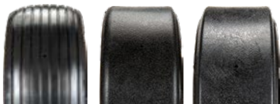
13" Grooved Polyresin Tread 13" Smooth Polyresin Tread 15" Smooth Polyresin Tread