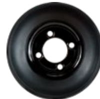
MSPN 78245 Utility cart hub (shown above)