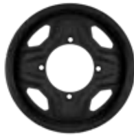
MSPN 75085 & 82599