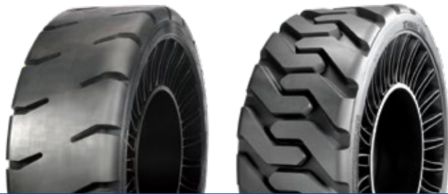
MSPN 45604 / CAI 976836 Hard Surface Traction