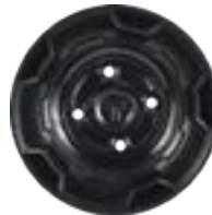
MSPN 01133 Golf cart hub (includes center dust cap)