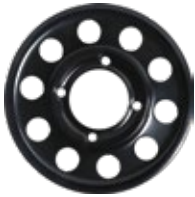
MSPN 21709 & 29242