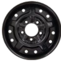
MSPN 49265 & 10545